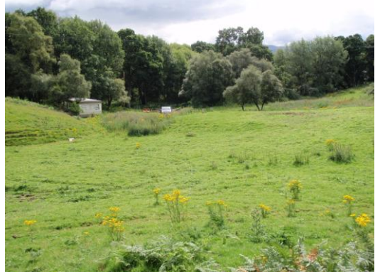
Figs 4 & 5 Areas for site of reception/manager's house (to right of caravan)