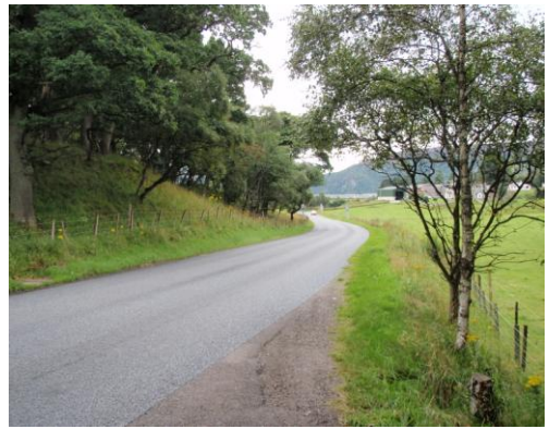
Fig. 2 Original proposed access Fig. 3